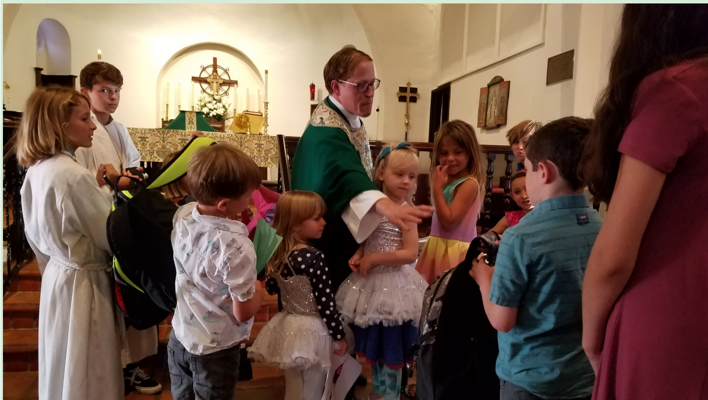
Blessing of the Backpacks 2016

We hope that our many children that came to have their backpacks blessed for the new school year are having a great start to the new year. We would also like to report that thanks to the many school supply donations we were able to supply over 70 complete kits to families in need this year. Thank you for your support!