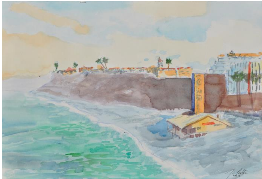
Jim Prothero, Artist

15" x 22" Watercolor of early morning on the north side of main beach.