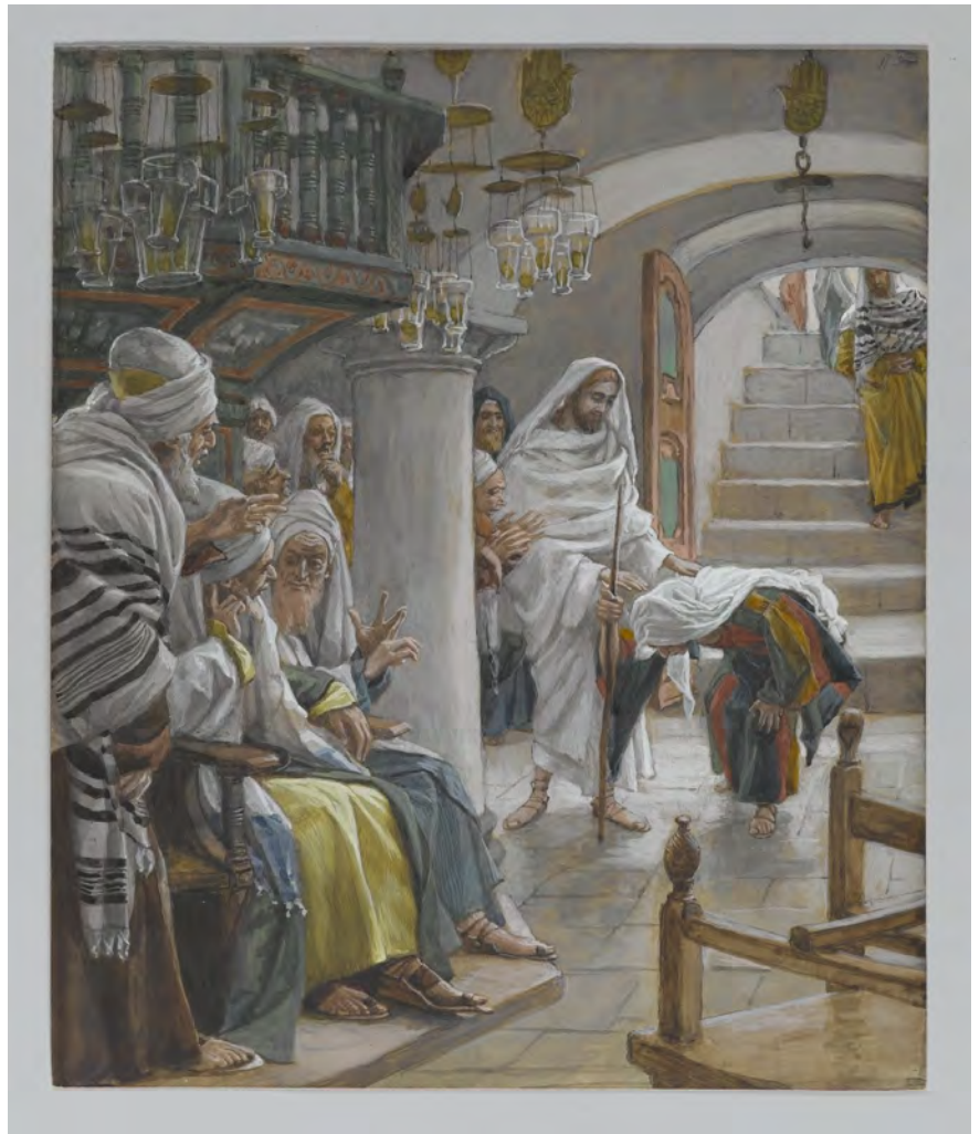
Christ healing an infirm woman on the Sabbath , by James Tissot, 1886-1896, Brooklyn Museum