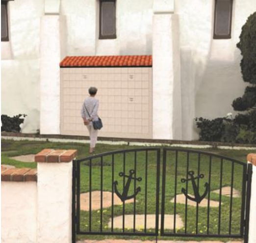
Architectural rendering of future columbarium