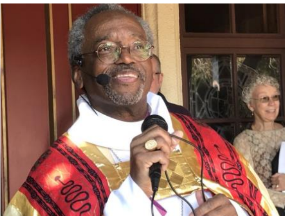
Episcopal Presiding Bishop Michael Curry exuberantly preaching at the Revival

During my 200-mile drive back to San Clemente my mind and heart were full of the energy and biblical underpinning for the revival. The Diocese of San Joaquin takes as its motto, "Called to Be ...," with the "..." an integral part of that theme. With this Revival, the challenge for Episcopalians was very much what is each of us called to be? So it is fitting for me, as I reflect on this outward and visible journey, is what is God called me to be? Or said another way, "What am I doing to make this world a better place, and how can I do more?"