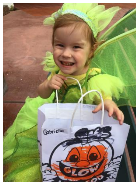
Chocolate Smiles all around!