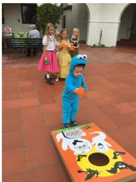
Bean Bag Toss with Cookie Monster