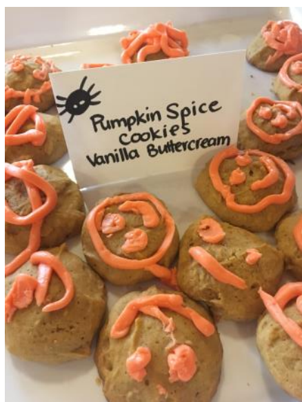
Frosted Cookies... Yum!

A huge thank you to the members of the congregation who donated candy and contributed to the pumpkin buffet!