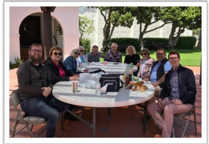
Choir lunch—May 2021

In mid-August, the choir began meeting in the parish hall to commence rehearsing in preparation for our September 12 debut. The purpose of the rehearsals has not only been to study, learn and prepare anthems for the services but also to dust-off our proverbial vocal "cobwebs" that have accumulated during the pandemic. We have been rehearsing with each singer masked and distanced. Singing with a mask can be a bit of a challenge. So, we've been experimenting with a few different types and identifying those that work better for us.