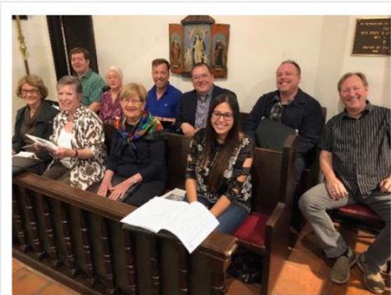
Choir members before service—May 2019

At the September 12 service, you will notice the choir seated in a new configuration. The purpose of the new seating/standing arrangement is to minimize as much as is possible the spread of COVID-19 while preserving the beautiful sound of the choir. In that spirit, the choir will remain stationary in those positions during the service.