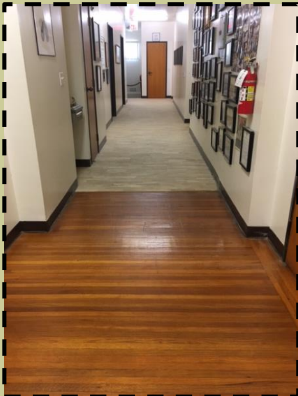
Hallway—before & after