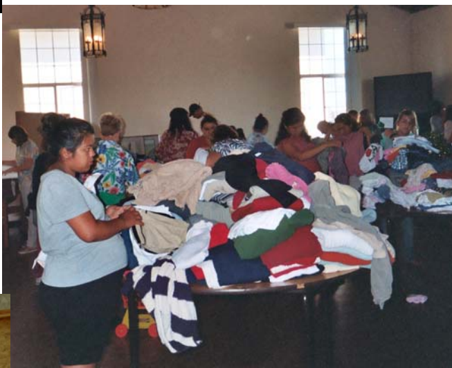
Annual Rummage Sale