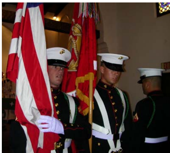
USMC Color Guard