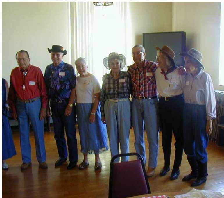
Saints and Sinners “Round-Up”