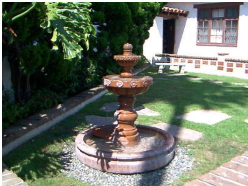
Memorial Garden Fountain