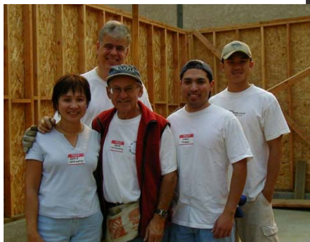
Habitat for Humanity